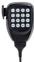
Keypad Speaker Microphone MM300DK