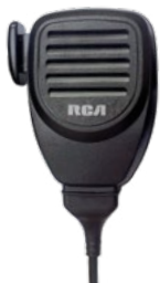
Speaker Microphone MM300D