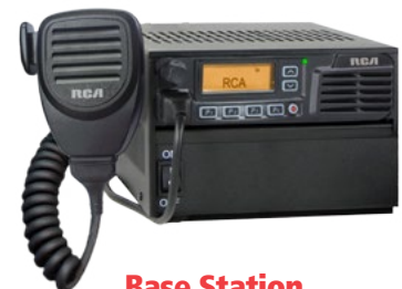
Base Station Conversion Kit BSC300D PKG