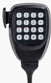
Optional MM300DK Keypad Microphone