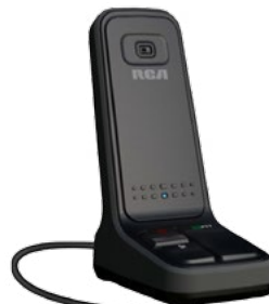
Desktop Microphone DMM1250